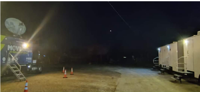
MOVE-2 providing lighting for showers and restroom facilities for residents

The team distributed power banks, supplied internet for FEMA assistance registration, supported the Red Cross, and provided many community residents with internet. The people there were so thankful for the assistance and were very kind to the MOVE volunteers. Many lost their homes and yet were smiling, working together to recover, and doing things for the volunteers. They brought so much food it was hard to eat it all. The town is turning on power where homes have been inspected to be safe. But many are waiting for issues to be resolved and are still homeless today. This is a beautiful rural town and it will be beautiful again soon.