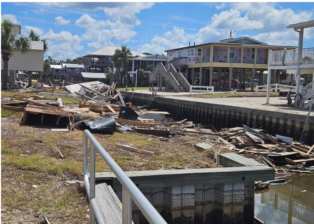
Damage caused by Hurricane Idalia

The team distributed power banks, supplied internet for FEMA assistance registration, supported the Red Cross, and provided many community residents with internet. The people there were so thankful for the assistance and were very kind to the MOVE volunteers. Many lost their homes and yet were smiling, working together to recover, and doing things for the volunteers. They brought so much food it was hard to eat it all. The town is turning on power where homes have been inspected to be safe. But many are waiting for issues to be resolved and are still homeless today. This is a beautiful rural town and it will be beautiful again soon.