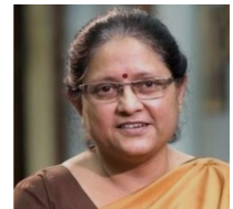
Sanghamitra Bandyopadhyay India